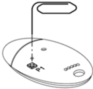
Old type Mitto

(If it has no hidden button use the top two front buttons together instead)